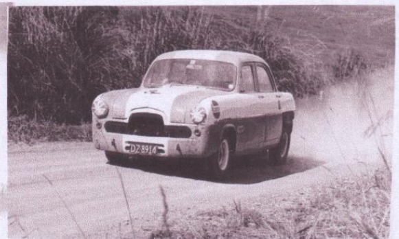
Brian Skudder Ford Zephyr V8 Ormandy Road