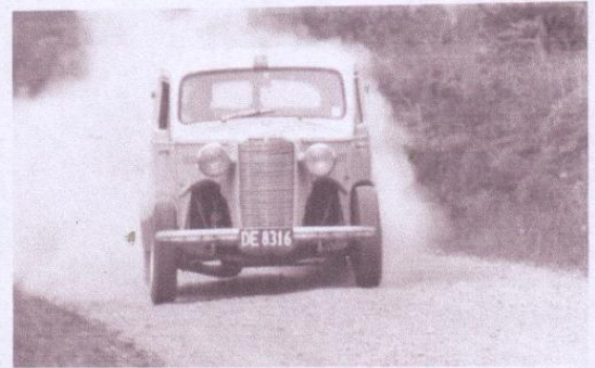
Fred Courtney Vauxhall J / Dodge 6 Ormandy Road