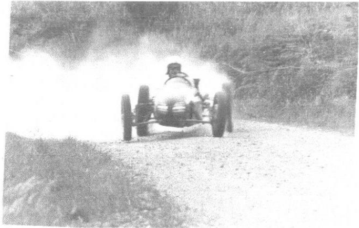
Ian Cullen Cooper Imp Ormandy Road