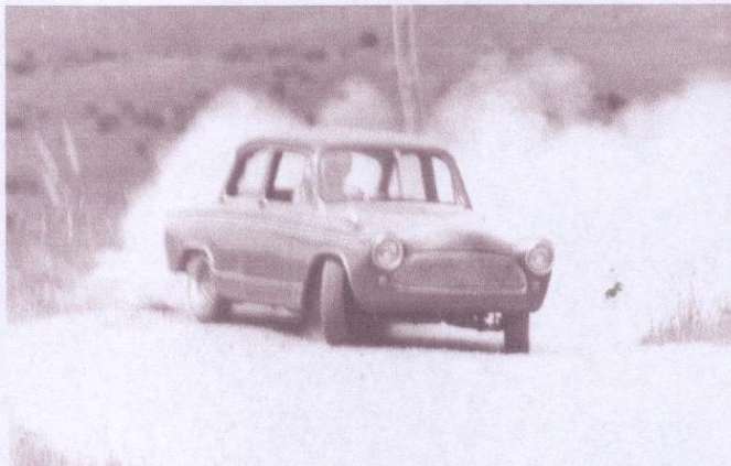
Simon Bliss Simca / Zephyr s/c Ormandy Road