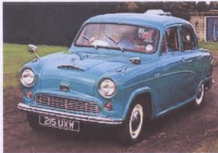
These 2 pictures not actual cars but sample pictures.