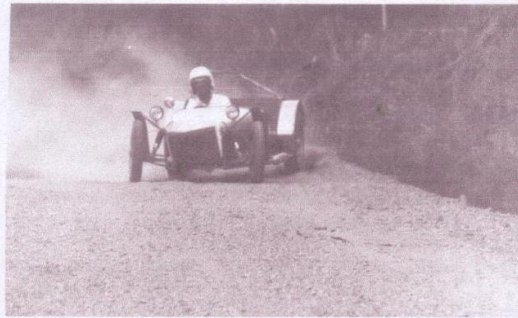
Doug. Swinbourne Austin 87 Special Ormandy Road