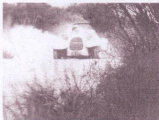
Geoff. Potter Ford V8 Sports [orig. called Chalmers Spl.]